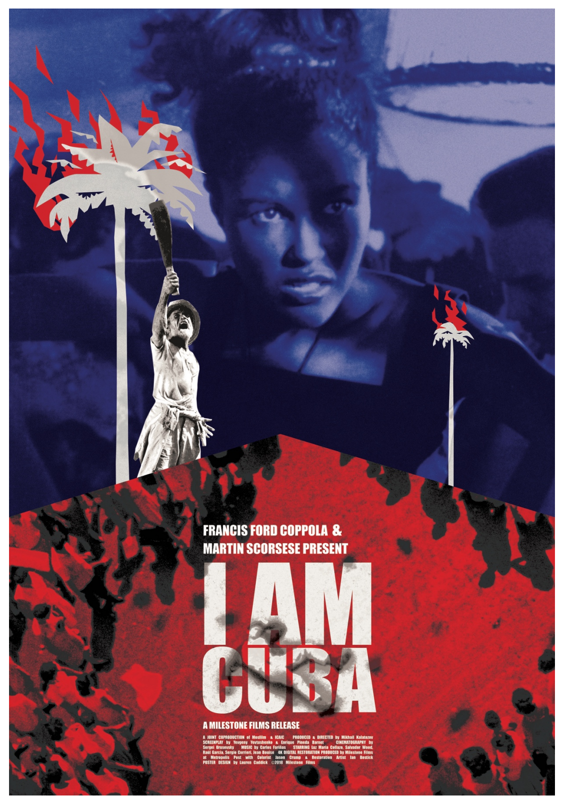
Winner: Special Archival Award from the National Society of Film Critics

A Milestone Film Release • PO Box 128 • Harrington Park, NJ 07640-0128 Email: milefilms@gmail.com • www.milestonefilms.com